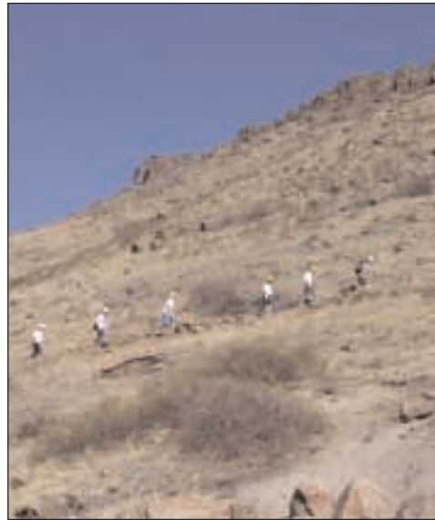
51 students from the Golden High School/American Red Cross Youth Corps volunteered for a Golden High School "signature project" at the Access Fund's North Table Mountain property in May.