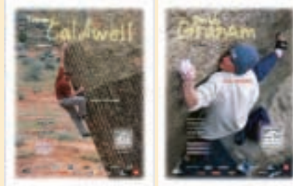
16.5" x 24" 2002 Bouldering Campaign posters of Tommy Caldwell and David Graham. $9.95