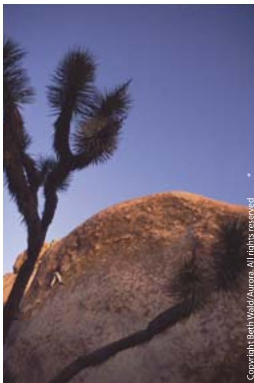
Joshua Tree National Park, California

In 2002, the AF awarded over $120,000 in grants. In the first half of 2003, $30,000 was awarded to assist parking improvements, campgrounds, trailhead facilities, land acquisitions, and provide organizational and start-up assistance for Local Climbing Organizations nationwide. Your support makes this generous funding possible.