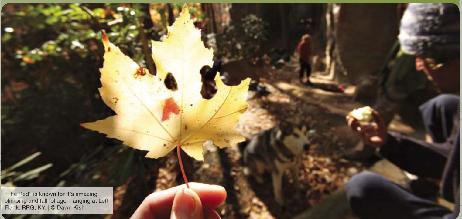
"The Red" is known for its amazing climbing and fall foliage. hanging at Left Flank, RRG, KY.