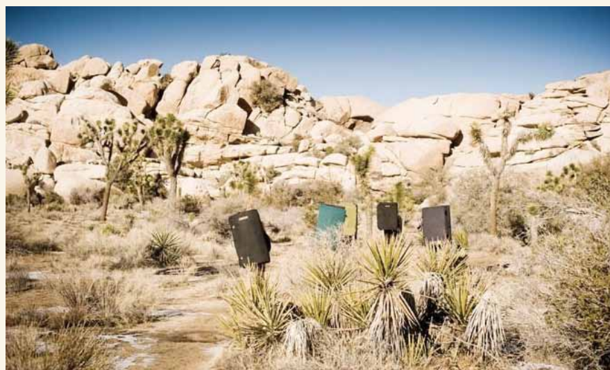
Most of Joshua Tree National Park sits within the Joshua Tree Wilderness, designated by Congress in 1976 and managed by the National Park Service.

While fixed anchors have been at the center of the Wilderness climbing controversy, they aren’t the entire story. Other behaviors in Wilderness are also stirring up emotions.