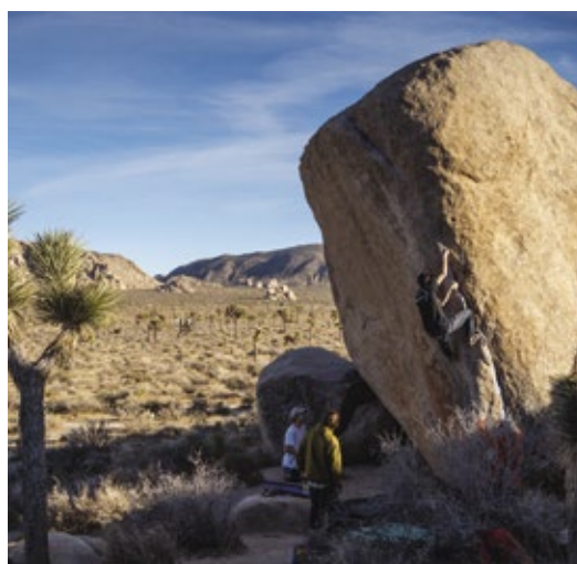
Joshua Tree National Park, California. Ancestral lands of Serrano and Western Shoshone.

Access Fund expects to see a draft of the plan in early 2023. We will mobilize climbers to weigh in when it’s released.