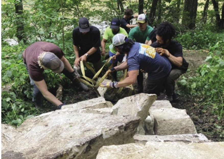
Climbers at work in Pictured Rocks County Park, Iowa. Ancestral lands of Ioway, Sauk, Fox, Ojibwe, and Kickapoo.

Read more about the project in this dispatch from the field in the Conservation Team's own words.