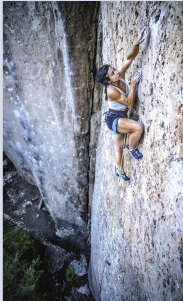
Ten Sleep, Wyoming. Ancestral lands of Eastern Shoshone, Apsáalooke, Tsésthó'e, and Ochéthi Sákówinj.