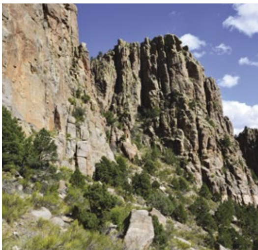
Unaweep Canyon. Ancestral lands of Nuu-agma-tv-p.