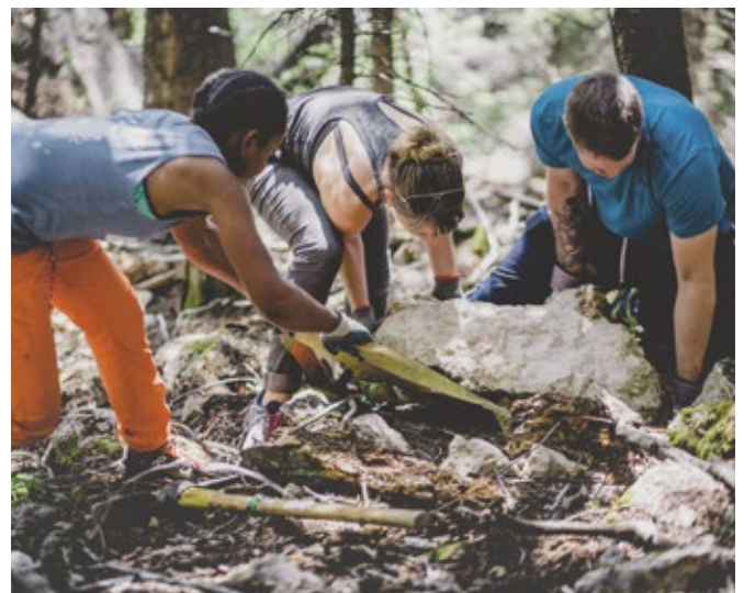
Climbers moving stone during a trail day in Ten Sleep Canyon, Wyoming. Ancestral lands of Eastern Shoshone, Apsáalooke, Tsésthó'e, and Ochéthi Sakówiŋ.

Climbers are leading the charge in conserving, restoring, and protecting climbing areas across the country—often assuming the conservation mantle for lands where no one else is willing or able to step up. And we are playing a critical role in boosting campaigns to protect the larger landscapes and ecosystems that we all cherish.