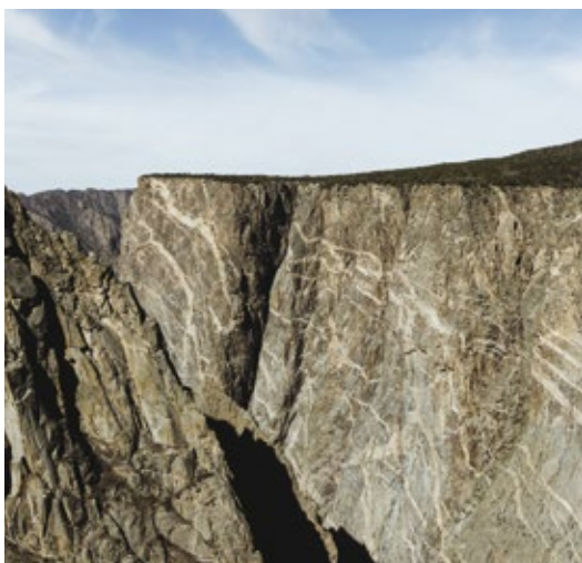
Black Canyon of the Gunnison, Colorado. Ancestral lands of Ute.

During the summer 2022 public comment period, climbers highlighted the plan’s significant shortcomings, including the way it treats fixed anchors in the Wilderness, antiquated raptor management strategies, and arbitrary limits on new routes and new access gullies. Access Fund will keep climbers updated on the final plan when it comes out, expected sometime in 2023.