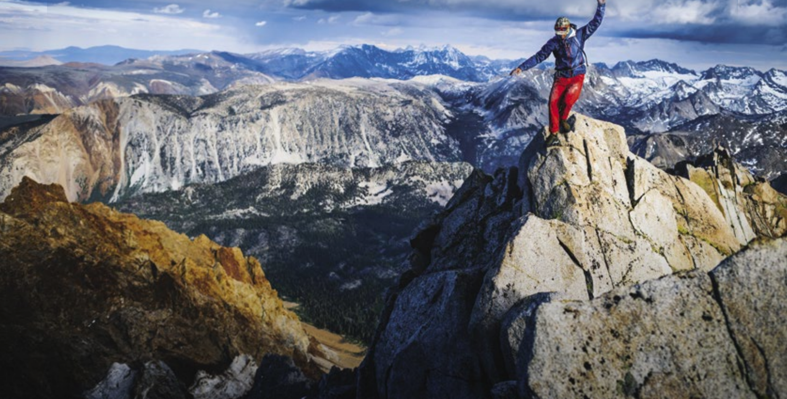
Mt. Emerson, Sierra Nevada range, California. Ancestral lands of Numu and Eastern Mono/Monache.