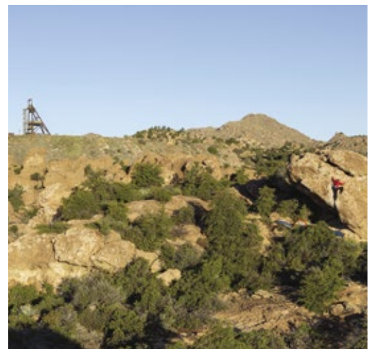
Oak Flat, Arizona. Ancestral lands of Apache, Akimel O'odham, and Hohokam.

The USFS is almost done with the bureaucratic process that is required by law in order to transfer Oak Flat to Resolution Copper, which is owned by a multinational mining conglomerate. An initial environmental impact statement (EIS) from the USFS included serious deficiencies that Access Fund and our partners identified and amplified. The administration saw those comments and asked the BLM to conduct an independent analysis, which found that the original EIS failed to take crucial factors into account that would have disastrous environmental results. The land transfer process is now on temporary hold to allow the USFS to address the BLM report, keeping Oak Flat safe for now and buying more time to pass legislation that would provide permanent protection.