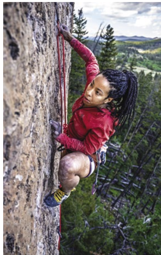
Ten Sleep, Wyoming. Ancestral lands of Eastern Shoshone, Apsáalooke (Crow), Tsésthó'e (Cheyenne), and Očhéthi Šakówiŋ.