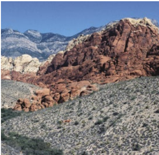
Red Rock Canyon, Las Vegas, Nevada. Ancestral lands of Southern Paiute and Western Shoshone.

That's where Access Fund comes in. Our public lands policy team monitors conservation and access issues so that we can activate the national climbing community at a moment's notice. We connect climbers with state and federal legislators, as well as high-level decision-makers at the National Park Service (NPS), Bureau of Land Management (BLM), United States Forest Service (USFS), and other federal agencies.