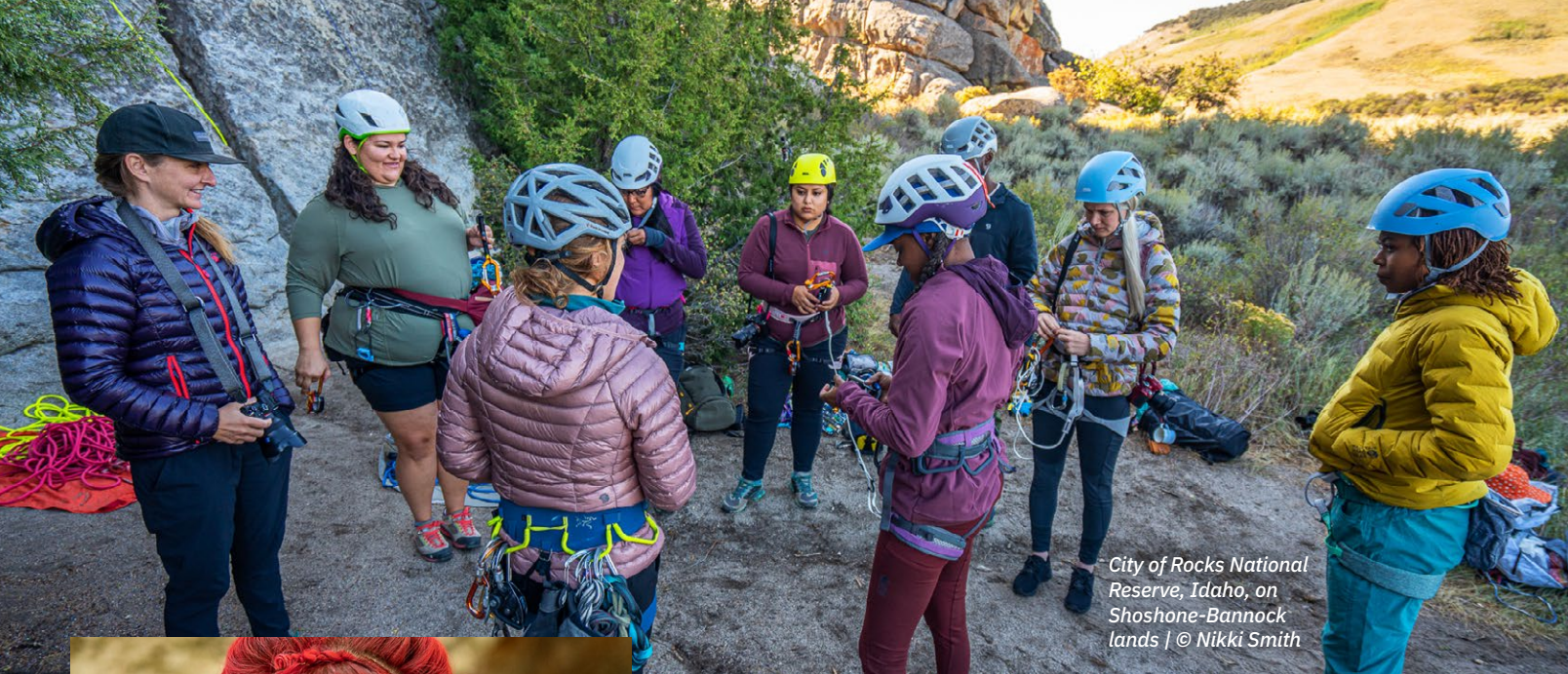
City of Rocks National Reserve, Idaho, on Shoshone-Bannock lands