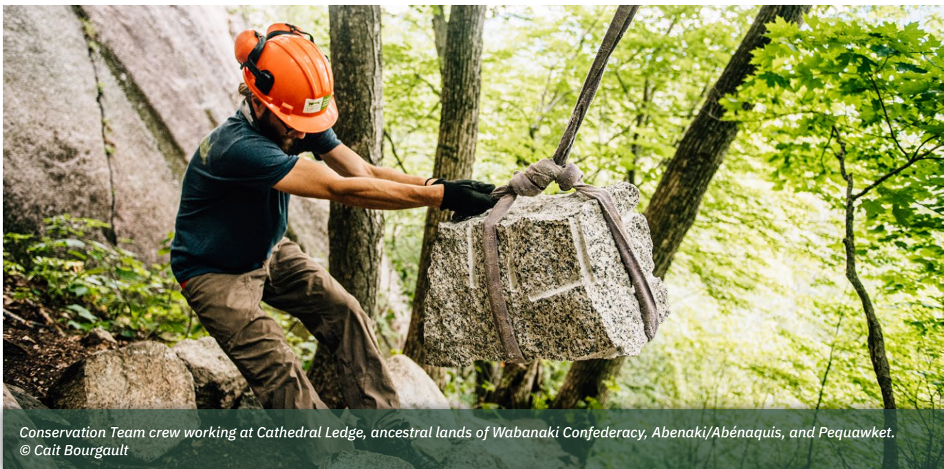
Conservation Team crew working at Cathedral Ledge, ancestral lands of Wabanaki Confederacy, Abenaki/Abénaquis, and Peqawket.

You can support the Access Fund–Jeep Conservation Team’s work to restore climbing areas by donating today at www.accessfund.org/donate .