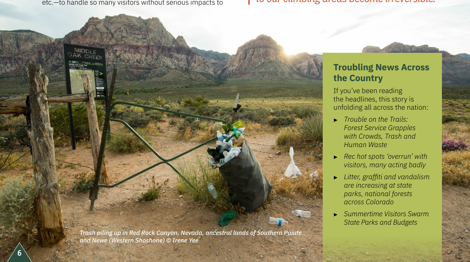
Trash piling up in Red Rock Canyon, Nevada, ancestral lands of Southern Paiute and Newe (Western Shoshone)

But we need your help. Now, more than ever before, we all have a responsibility to step up and protect the places we love, whether you have been climbing for 20 years or this is your first day outside. Donate today at accessfund.org/donate to help Access Fund expand our education and stewardship initiatives—before impacts to our climbing areas become irreversible.