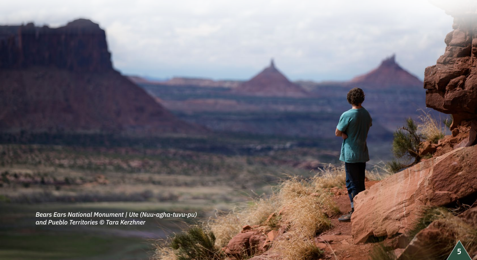
Bears Ears National Monument | Ute (Nuu-agma-tuvu-pu) and Pueblo Territories

We will keep you posted on any updates on the case.