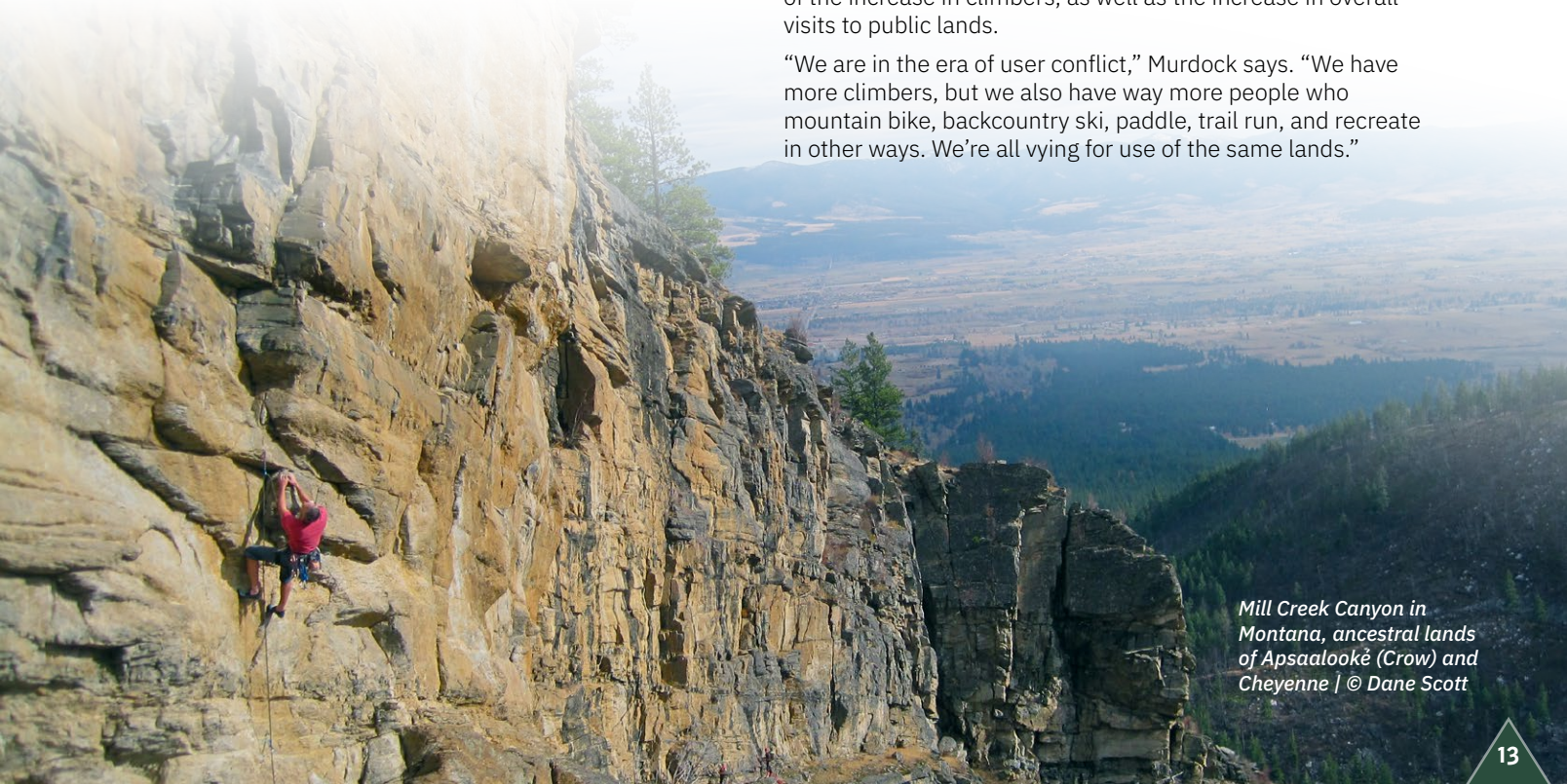
Mill Creek Canyon in Montana, ancestral lands of Apsaalooké (Crow) and Cheyenne

“We are in the era of user conflict,” Murdock says. “We have more climbers, but we also have way more people who mountain bike, backcountry ski, paddle, trail run, and recreate in other ways. We’re all vying for use of the same lands.”