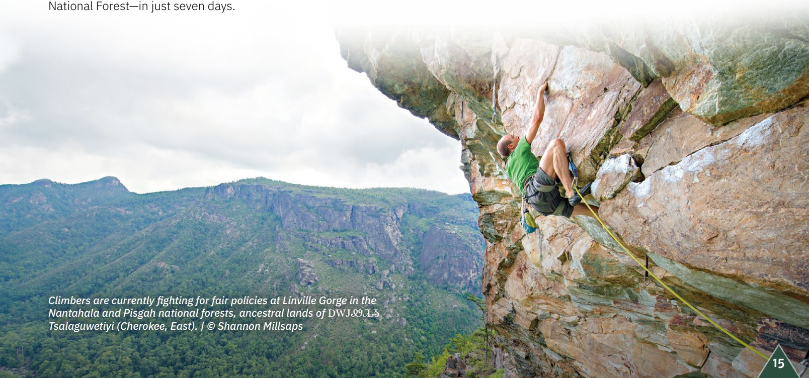
Climbers are currently fighting for fair policies at Linville Gorge in the Nantahala and Pisgah national forests, ancestral lands of ᏅᏍᏉᏞᏍᏔᏚᏗᏪᏛ Tsalaguwetiγi (Cherokee, East).