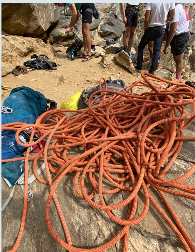
A crowded crag on the Colorado Front Range can see lines of three to four parties waiting for routes.

Climbing outdoors offers a pretty amazing way to stay sane during these difficult times—especially when medical experts agree that we’re all safer outside, in the open air. But let’s face it: Everyone and their mom is heading outside to recreate right now, and the crags and boulders are so crowded that it’s starting to impact the climbing experience, the environment, and access.